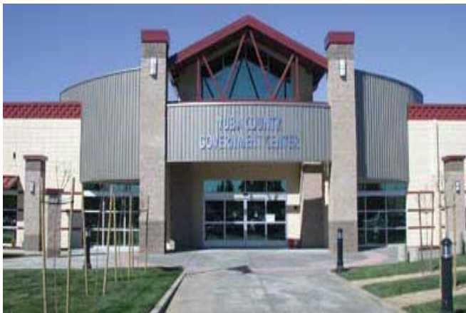
The new Yuba County Government Center in Marysville, CA.

Sutter and Yuba Counties are recognized as successful northern extensions of Sacramento's rapidly expanding region. Unprecedented residential building is driving the development of new retail and commercial establishments in the south county areas. The Yuba City Metropolitan Statistical Area (MSA), including Yuba & Sutter Counties, was ranked as one of the best places to do business by Forbes Magazine . Yuba County's strongest points include available and relatively inexpensive land and a low cost of doing business. Yuba County does not have a business license fee for most businesses, no utility user tax, no Regional Transportation Fee or Tax, no local sales tax on top of the state sales tax of 7.25%, no parking tax, and no Gross Receipts Tax.